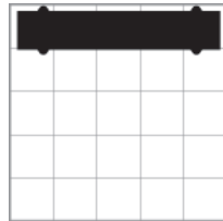
Aerial grid of 10' x 10' space

Our Timberline Hybrid Series gives you the ultimate in versatility. Customizable modular displays can be arranged in numerous configurations. Displays are easy to set up and adjust to fit any size area. Showcase your products for your tradeshows or special events with a variety of options such as reception desks and shelves.