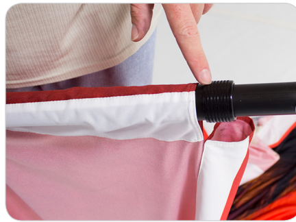
STEP8 Extend the top and bottom pole to desired length.