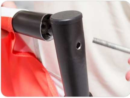
STEP7 Screw tight with each side pole.