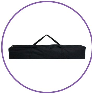
QTY 1: Black Nylon Carry Bag