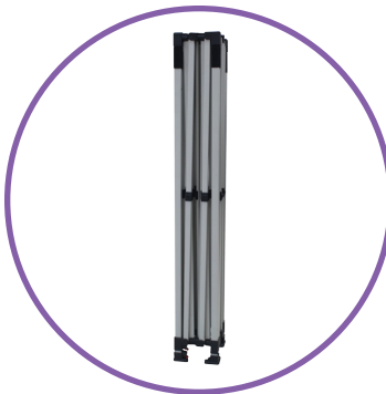
QTY 1: Frame w/ Pre-Installed Graphic

• 10" L x 10" W x 61 5/8" H (Collapse Frame)