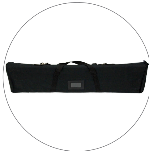
(QTY 1): Travel Bag