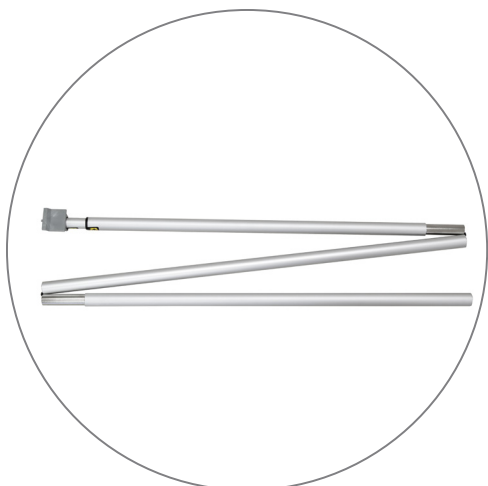
(QTY 1): Telescopic Pole