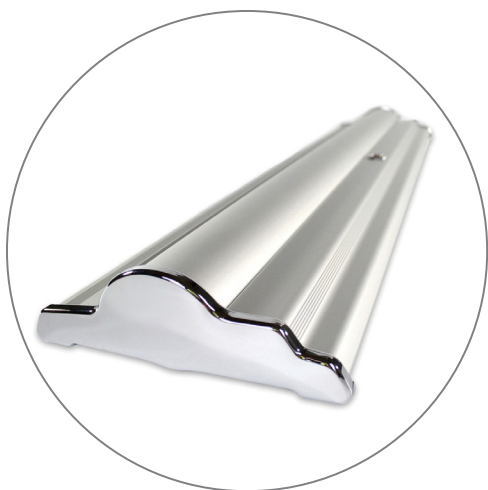
(QTY 1): Steppy Retractable Stand