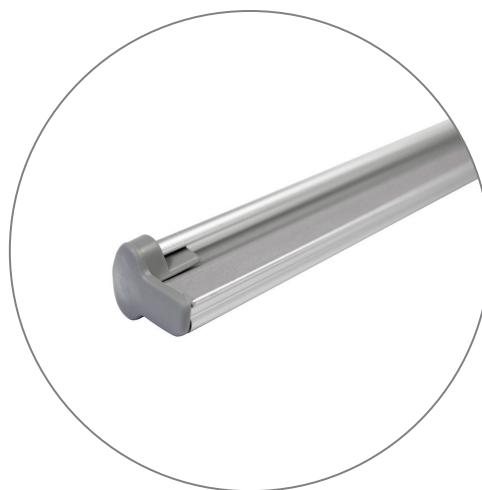
(QTY 1): Clamp Bar