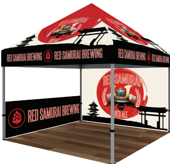
Angle View w/ Backwall & Half Side Wall