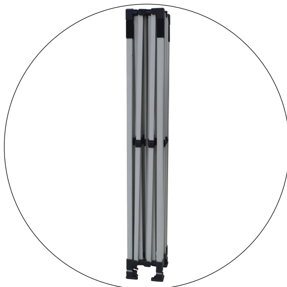
(QTY 1): Frame