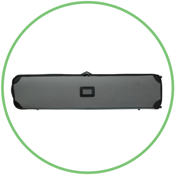
QTY 1: Silverbag