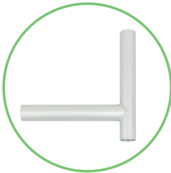
QTY 2: Bottom Corner Connectors