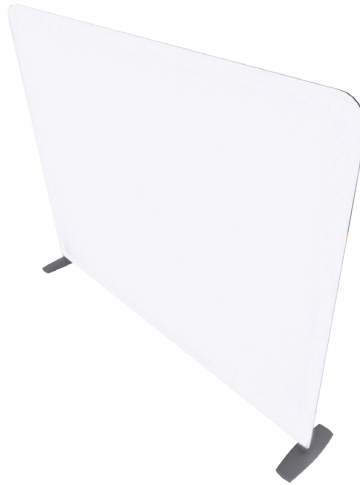
Single-Sided Back View