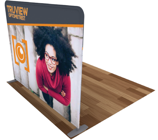
Double-Sided Back View