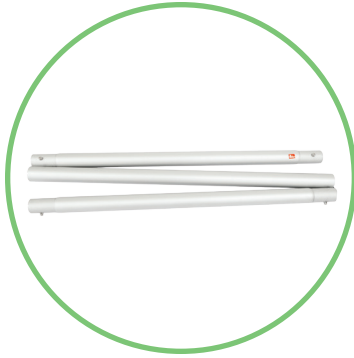
QTY 1: Bottom Horizontal Tube Set