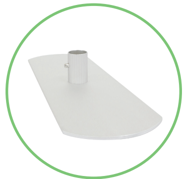
QTY 2: Feet