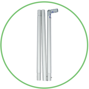
QTY 2: Vertical Tube Sets