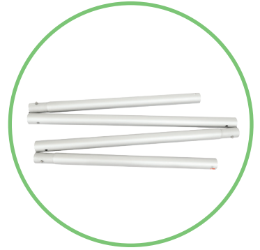
QTY 1: Top Horizontal Tube Set