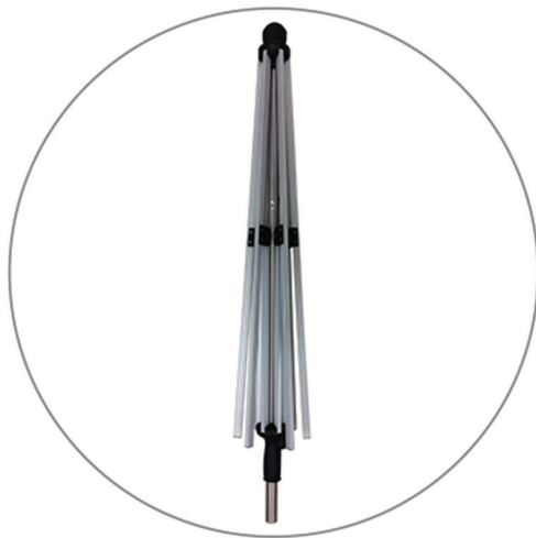
(qty 1) Umbrella frame