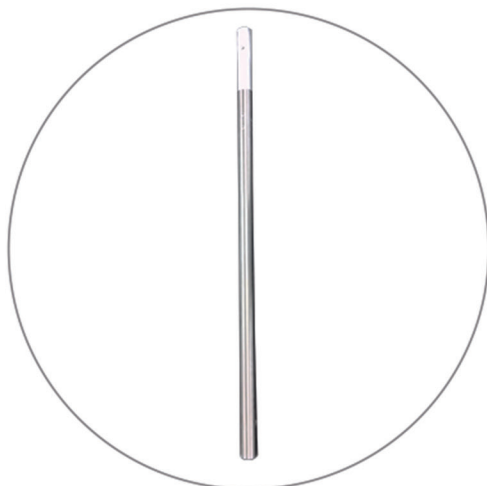
(qty 1) Lower extension