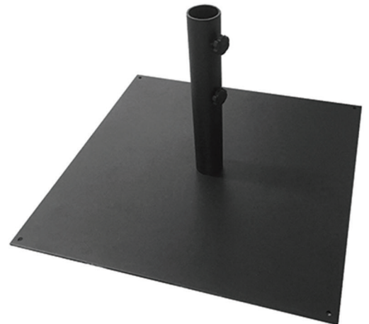
Iron Square Base (optional)