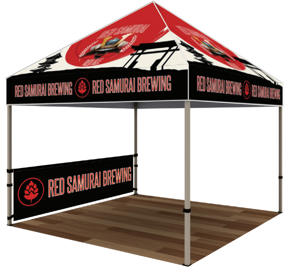
Half Side Wall Double-Sided