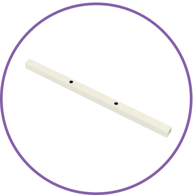
QTY 1: Rail Center Connector