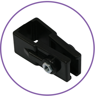
QTY 2: Rail Clamp