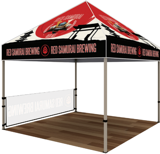
Half Side Wall Single-Sided