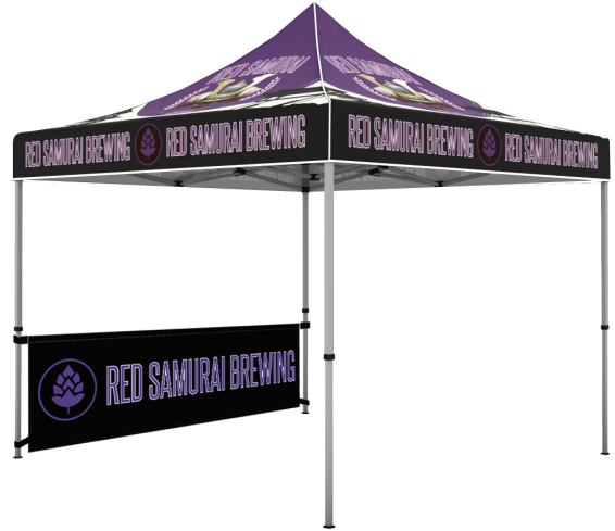
Half Side Wall Double-Sided