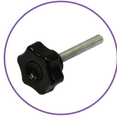
QTY 2: Rail Clamp Screw