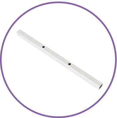
QTY 1: Rail Center Connector