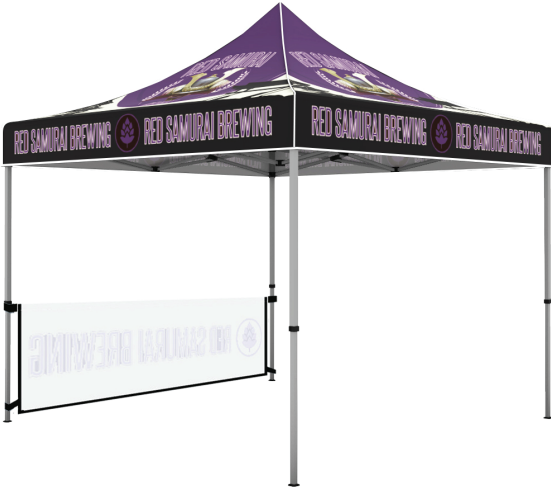
Half Side Wall Single-Sided