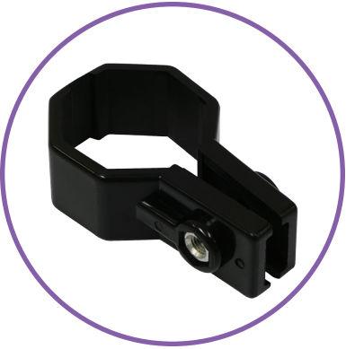
QTY 2: Rail Clamp Bar