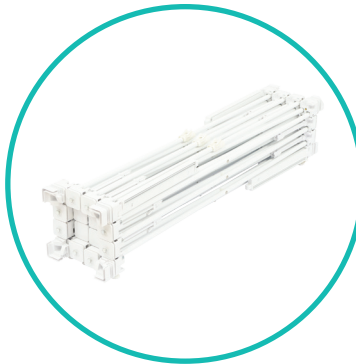
QTY 1: 3x3 Pop Up Frame

Outside Dimensions: • 35" L x 13" W x 10" H Inside Dimensions: • 35" L x 13" W x 10" H