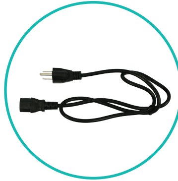
QTY 3: Power Cords

• 5 1/8" L x 2 1/4" W x 1 1/4" H (Transformer) • 58" L (Cord Length)