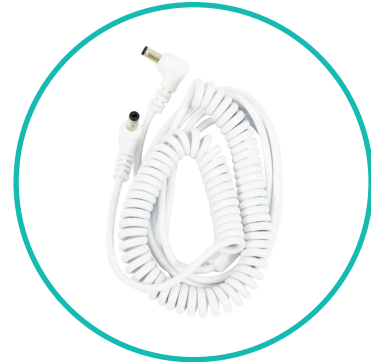
QTY 3: Edge Light Jumper Cords