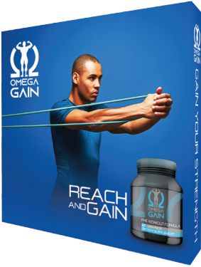
Non-Lit Front View