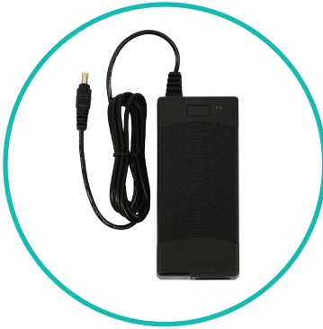
QTY 3: Transformers

• 5 1/8" L x 2 1/4" W x 1 1/4" H (Transformer) • 58" L (Cord Length)