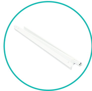
QTY 8: 3 Sectional Channel Bars

• 34 1/8" L x 6 1/2" W x 7 1/4" H (Collapse Frame)