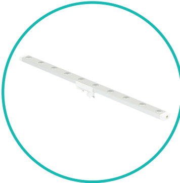
QTY 6: Edge Lights

Outside Dimensions: • 28" L x 6" W x 7 1/4" H Inside Dimensions: • 28 1/4" L x 6 1/8" W x 6 3/4" H