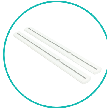
QTY 2: Stabilization Feet

Outside Dimensions: • 32" L x 6" W x 3 1/2" H Inside Dimensions: • 31 1/2" L x 6" W x 2" H