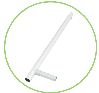
QTY 2: 20" Bottom Tubes