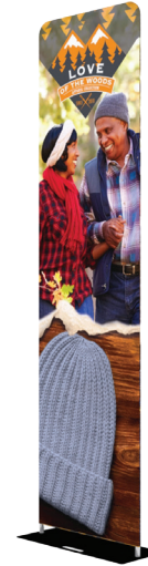
Double-Sided Back View