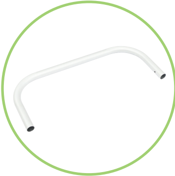
QTY 1: 24" Top Tube