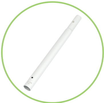
QTY 6: 12" Tubes