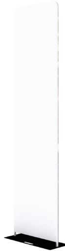
Single-Sided Back View