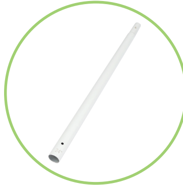
QTY 2: 24" Tubes