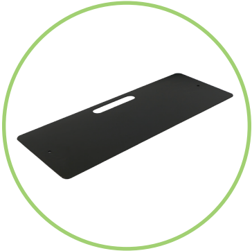
QTY 1: Steel Base