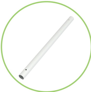
QTY 1: Horizontal Bottom Tube