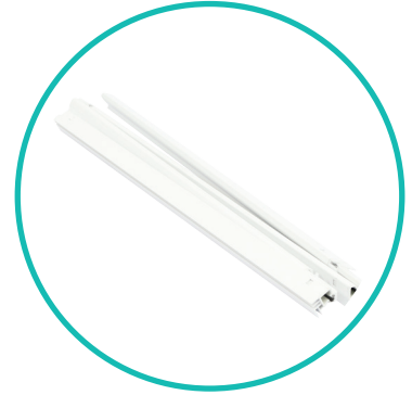
QTY 4: 4 Sectional Channel Bars

• 85 7/8" L x 1 1/16" W (When assembled)