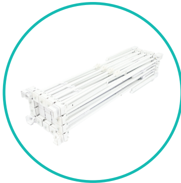
QTY 1: 4x3 Pop Up Frame

Outside Dimensions: • 35" L x 13" W x 10" H Inside Dimensions: • 35" L x 13" W x 10" H