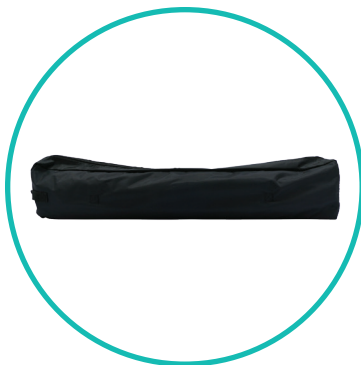
QTY 1: Channel Bar Bag

• 114 3/8" L x 1 1/16" W (When assembled)