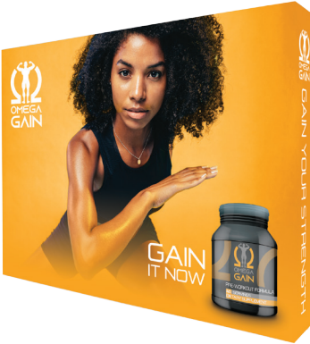
Non-Lit Front View