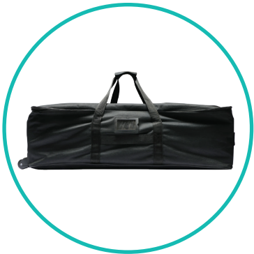
QTY 1: Travel Bag with Wheels

Outside Dimensions: • 35" L x 13" W x 10" H Inside Dimensions: • 35" L x 13" W x 10" H