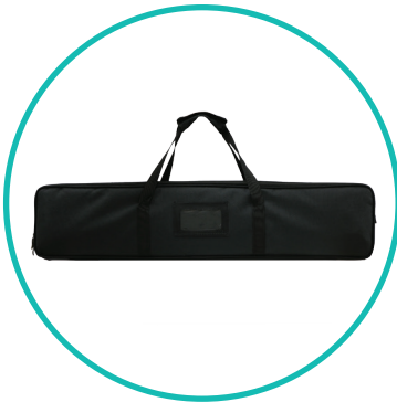
QTY 1: Edge Light Travel Bag

Outside Dimensions: • 28" L x 6" W x 7 1/4" H Inside Dimensions: • 28 1/4" L x 6 1/8" W x 6 3/4" H