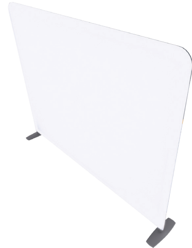
Single-Sided Back View