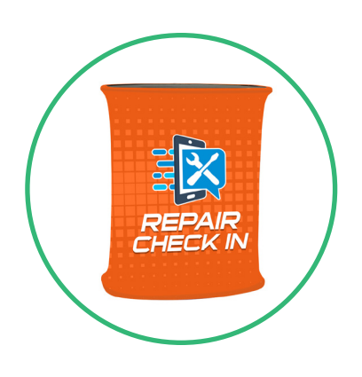
QTY 1: Gopher Pop Up Counter w/Graphics