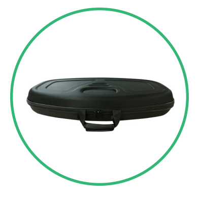
QTY 1: Travel Bag